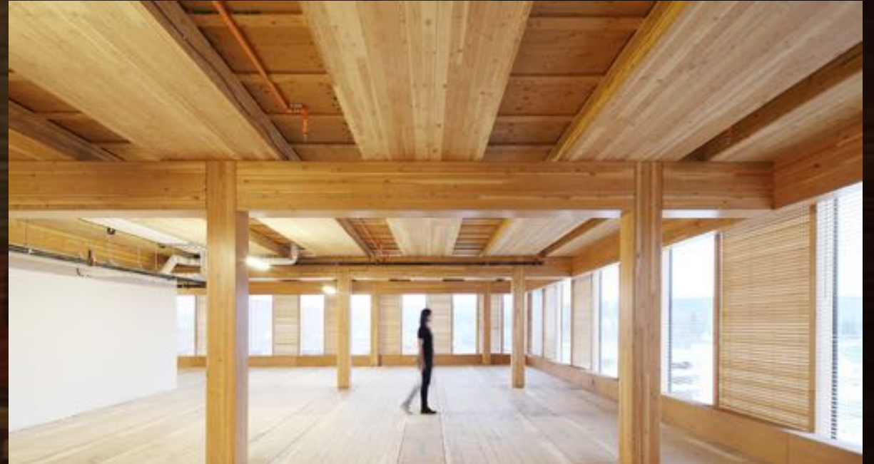
Katerra – Mass Timber Structure