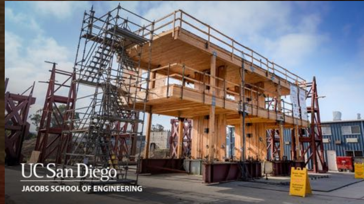
Mass Timber Building Shake Table Test, UCSD