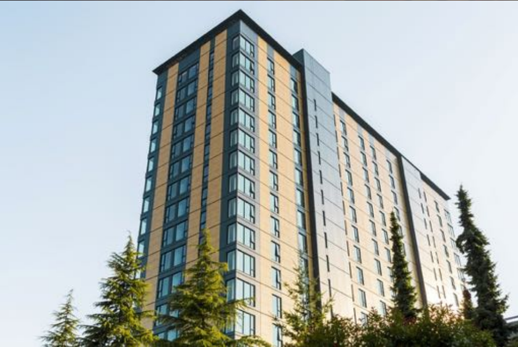
Brock Commons, BC – Mass Timber Student Housing